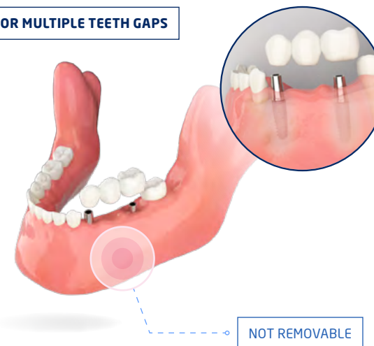
FOR MULTIPLE TEETH GAPS

For those with multiple missing teeth, an optimal treatment option can be an implant-supported restoration with a fixed bridge or crowns. The implant fuses with the jaw, which results in a secure bond between the implant and surrounding bone, providing a confident feeling and a nice aesthetic effect. Unlike traditional bridge replacements implant replacement leaves surrounding teeth intact.