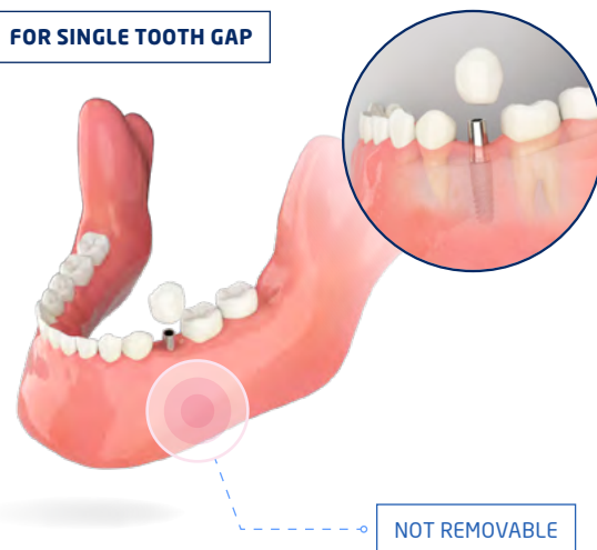
FOR SINGLE TOOTH GAP

If you have one tooth missing, you can have an implant to support a new single crown. The replacement tooth is attached to an implant, with a connecting abutment. The implant fuses with the jaw, which results in a secure bond between the implant and surrounding bone, providing a confident feeling and a nice aesthetic effect. Unlike traditional bridge replacements implant replacement leaves surrounding teeth intact.