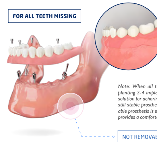
FOR ALL TEETH MISSING

Note: When all teeth are missing, planting 2-4 implants can also be a solution for anchoring a removable but still stable prosthesis. Such a removable prosthesis is easy to clean, yet it provides a comfortable, safe wearing.